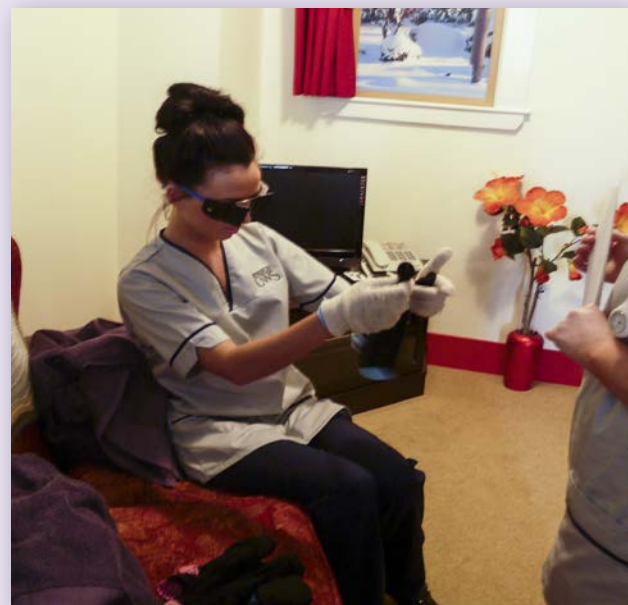
A student experiences the Virtual Dementia Tour

Learning by experience and simulation is valued by the University and the team have introduced the Virtual Dementia Tour® for all year one student nurses.