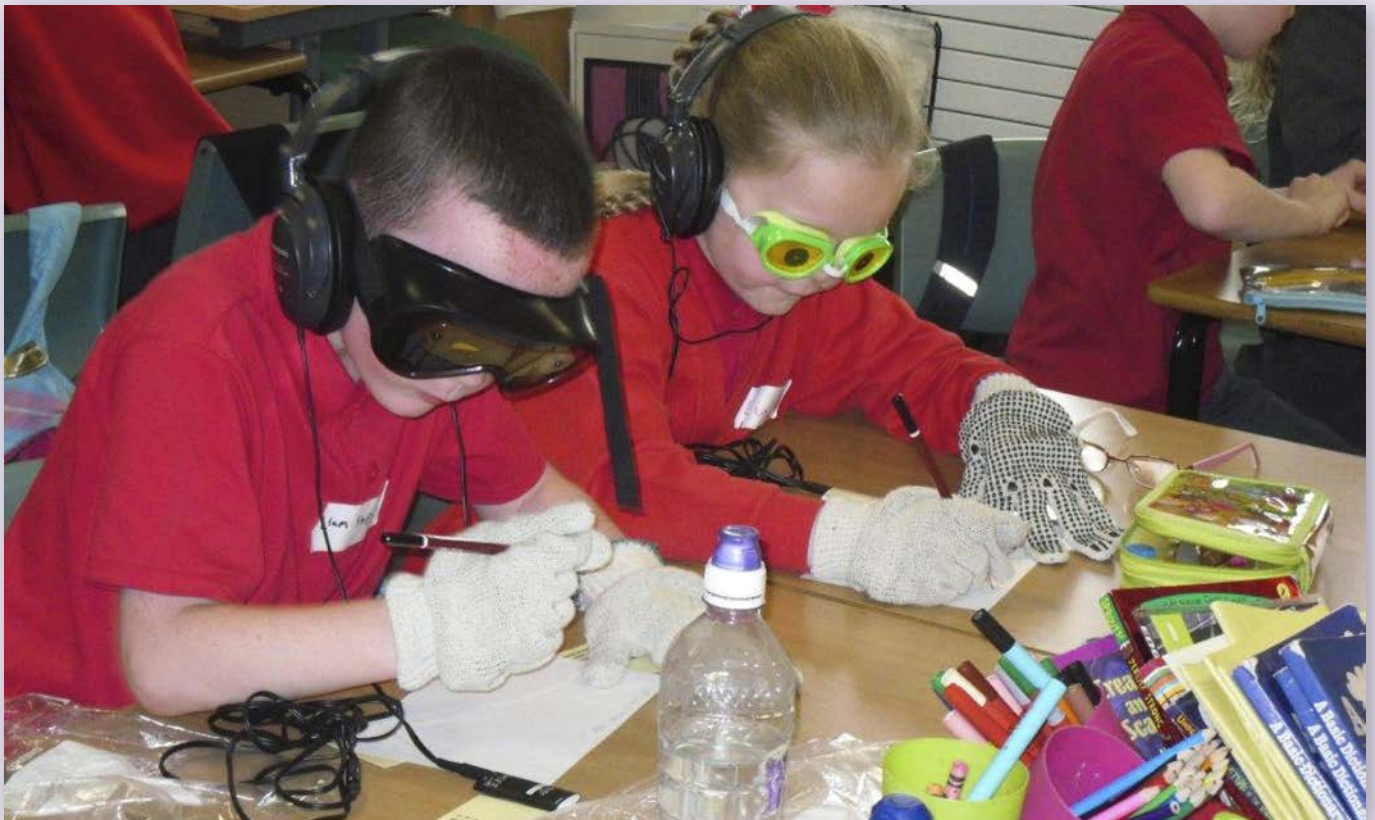
The children are experiencing a modified Virtual Dementia Tour with some challenges to their vision and grasp

This initiative is being evaluated by lecturing staff in a small-scale research study and has indicated positive outcomes. It is intended that this will contribute to addressing stigma, in relation to the person with dementia, in even our youngest citizens. In addition student evaluation of the Programme very important, and there are some comments already available from the year one group. Their enthusiasm is obvious as they talk about enjoying the learning experiences offered to them.