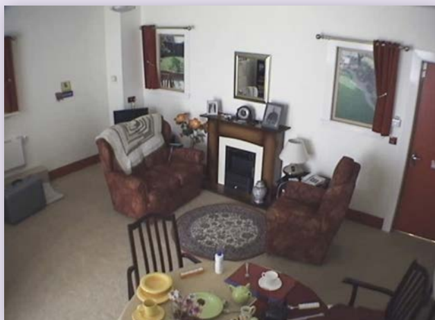
The Domus Initiative

Before delivery of this Programme, all lecturers from the pre-registration programme were offered interactive workshops to share dementia-focussed knowledge, skills and experience. This ensures that teaching and learning approaches are current and consistent across the four campus sites and teams. This has led to the development of a core interest group among the teaching staff, which has proved a source of innovation and research and continues to drive the developing programme of learning.