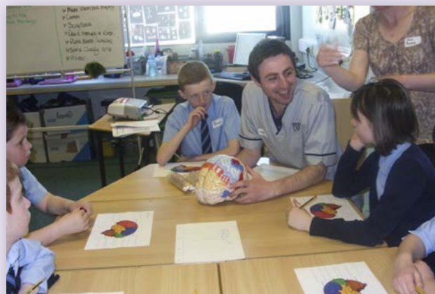
A student working with primary school children to help them understand the human brain

The new Programmes began in 2012 but there are students still completing the previously validated Programme and the team were keen to ensure they were included in this process. Therefore, their learning has been supplemented and directed by the Dementia Skilled-Improving Practice materials provided by NHS Education Scotland and the Scottish Social Services Council. A reflective framework has been produced to allow these senior students to map this learning to personal outcomes before completing their course.